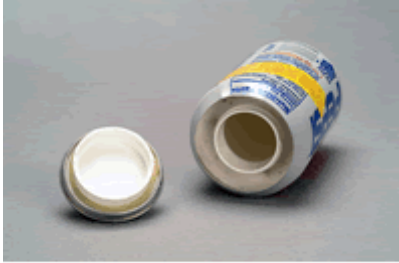
Soft drink can with false bottom.

The drug paraphernalia statute, U. S. Code Title 21 Section 863, makes it "unlawful for any person to sell or offer for sale drug paraphernalia; to use the mails or any other facility of interstate commerce to transport drug paraphernalia; or to import or export drug paraphernalia."