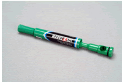
Felt tip marker with internal drug pipe.