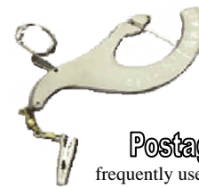
Postage Scale frequently used to weigh drugs