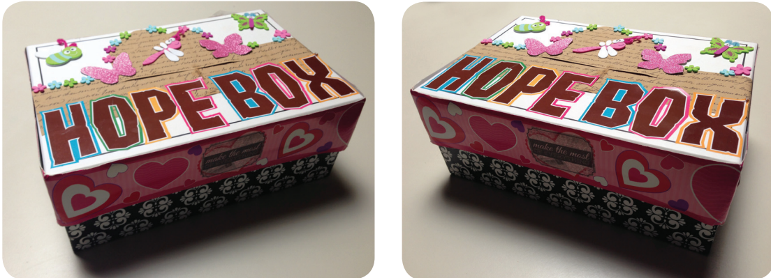
Hope box created by DHSPC support group participant

The group culminated with difficult discussions in weeks four, five, and six. This week keeps the group in the moment with a creative activity, as next week's goodbyes may be on participants' minds.